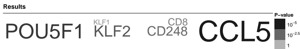
Figure 6: User supplied wordcloud data as one components

> # To get two word clouds per block use neted lists > gs = gosummaries(wc_data = list(Results = list(wcd1, wcd2))) > plot(gs, filename = "figure6.pdf")