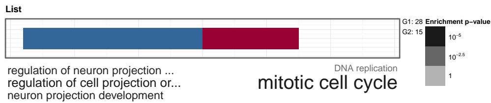
Figure 2: Simplest GO summaries figure.

In this example we had only the gene lists and no additional data to display in panel. In these situations GOsummaries displays by default just the number of genes.