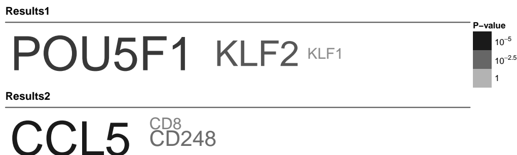
Figure 5: User supplied wordcloud data as two components

> gs = gosummaries(wc_data = list(Results1 = wcd1, Results2 = wcd2)) > plot(gs, filename = "figure5.pdf")