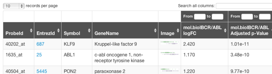
Figure 5: Resulting page created for analysis of a microarray study with limma .