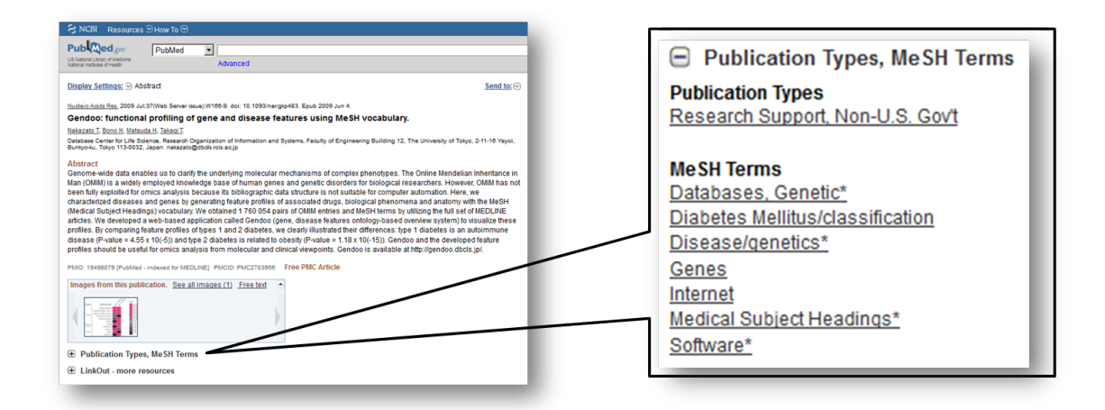
Figure 1: MeSH Term

This document provides the way to use MeSH-related packages; MeSH.db, MeSH.AOR.db, MeSH.PCR.db, MeSH.XXX.eg.db-type packages, MeSHDbi, and meshr packages. MeSH (Medical Subject Headings) is the NLM (U. S. National Library of Medicine) controlled vocabulary used to manually index articles for MEDLINE/PubMed [1] and is a collection of a comprehensive life science vocabulary. MeSH contains more than 25,000 clinical and