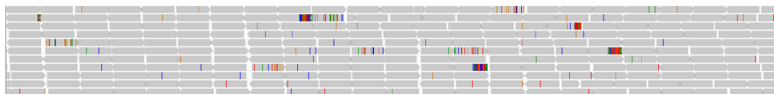
Figure 3: Simulated reads mapped in proper pair. Mismatches and soft-clips are shown as colored vertical lines in reads.