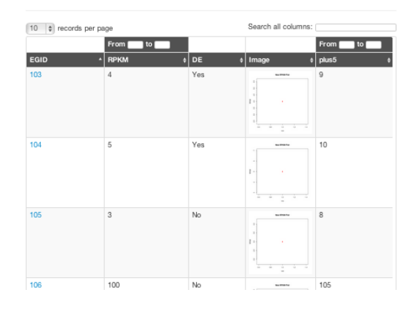
Figure 3: Resulting page created after adding figures and links to table with .modifyDF.