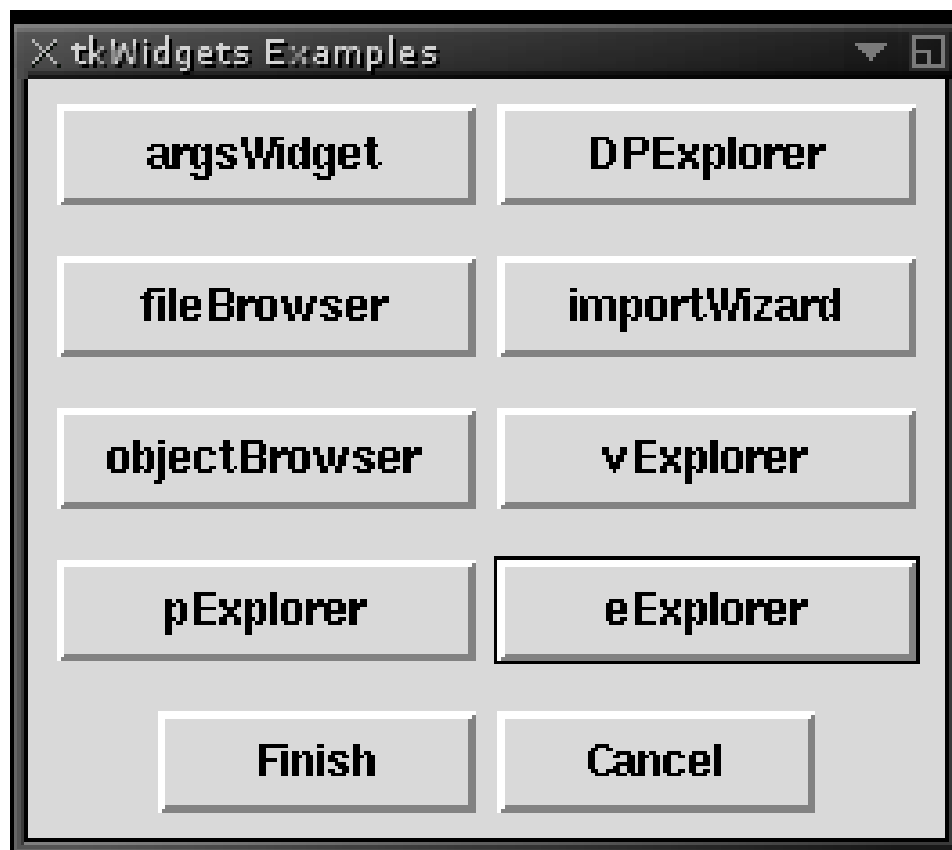
Figure 1: A snapshot of the widget when the example code chunk is executed