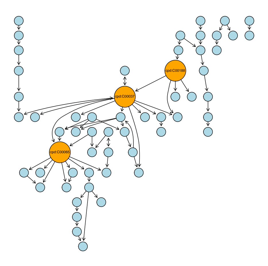
Figure 3: Reaction network built of chemical compounds: the orange nodes are the three compounds with maximum out-degree in this network.