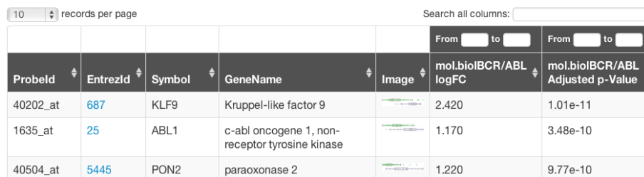
Figure 5: Resulting page created for analysis of a microarray study with limma .