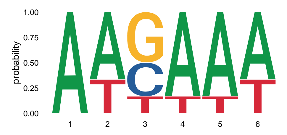
Figure 1: Sequence logo of a Position Probability Matrix