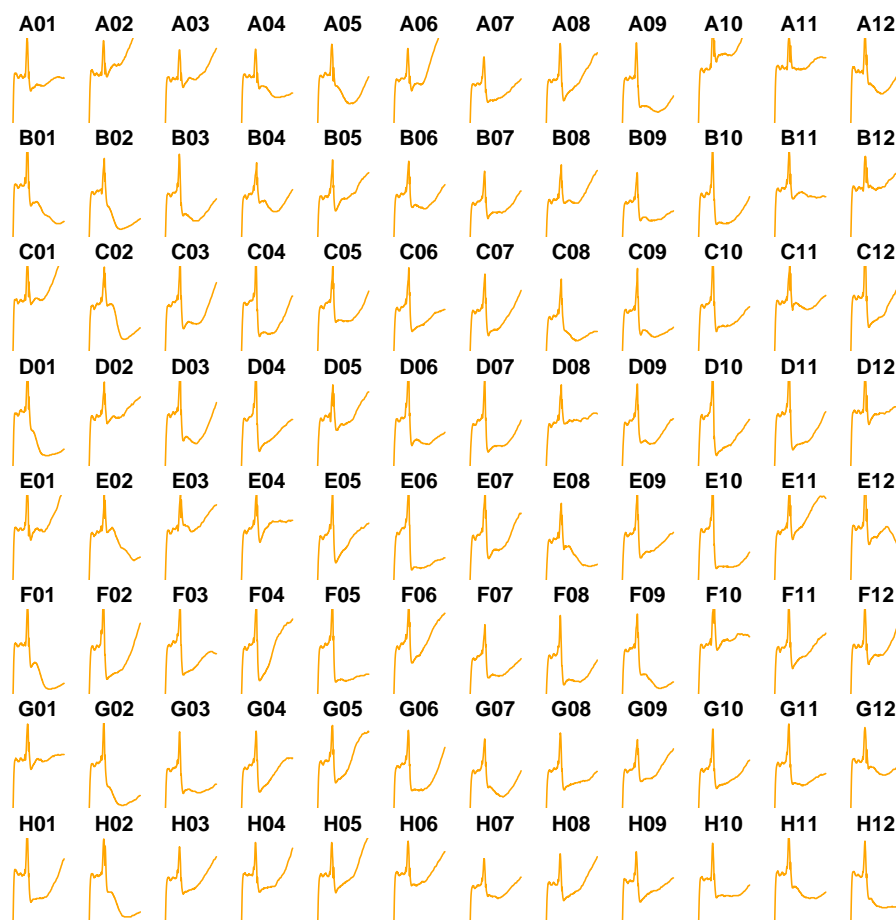
Figure 3: Plate view of a 96-well E-plate from a RTCA assay run.